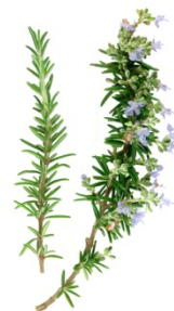
Neroli, Bergamot, Lavender, Rosemary

Sponsored by Coeur d'Esprit Natural Perfumes in Coquitlam, British Columbia, Canada